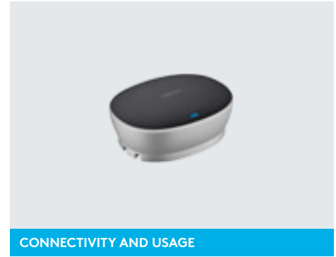
CONNECTIVITY AND USAGE

Simply plug the speakerphone into the powered hub with the supplied 4.9 m/16' cable to get up and running in no time.